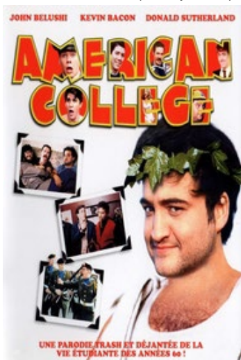
American College (J. Landis, 1977)