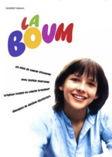
La Boum (C. Pinoteau, 1980)