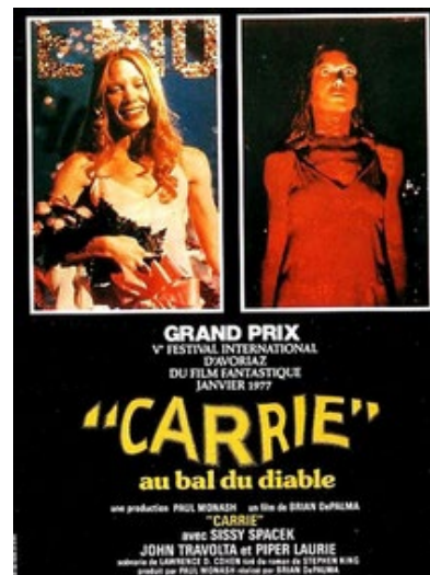
Carrie au bal du diable (B. de Palma, 1976)