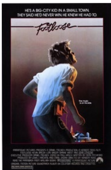
Footloose (H. Ross, 1984)