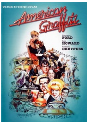
American Graffiti (G. Lucas, 1973)