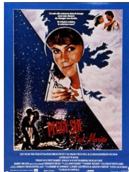
Peggy Sue s'est mariée (F. F. Coppola)