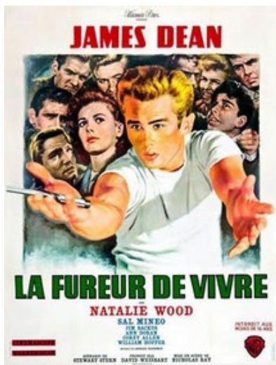
La Fureur de vivre (N. Ray, 1955)